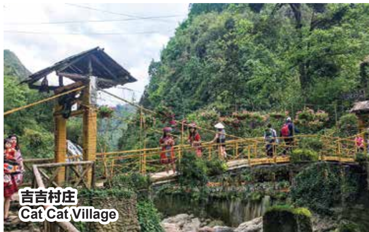
吉吉村庄 Cat Cat Village

After breakfast, free at your own leisure till assemble time, proceed to airport for flight back to Kuala Lumpur.