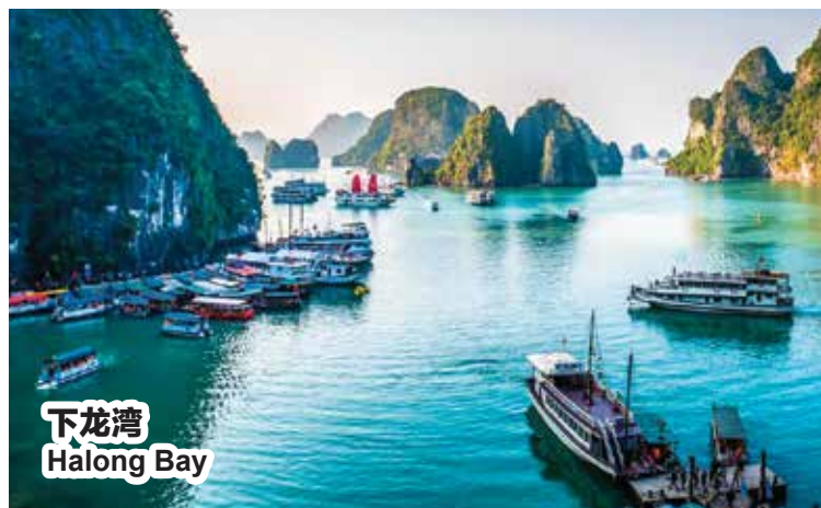
下龙湾 Halong Bay